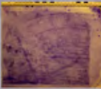
Recovery is achieved by using a 1% of gentian violet in 100% alcohol solution